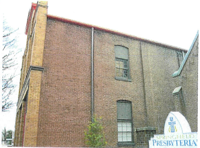
(Above-left) This is a photo of the SE elevation (left side) of the building. (Above-right) This is a detail photo of the window openings with replacement windows at the NW (right) elevation. (Below-left) This is a detail photo of the storefront. (Below-right) This is a detail photo of the second story façade.