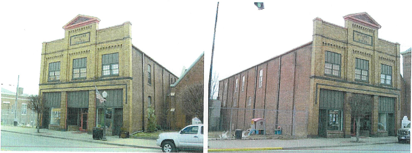
(Above-left) This is a NE/NW elevation showing the façade and right side of the building. (Above-right) This is a SE/NE elevation showing the left side and façade of the building.