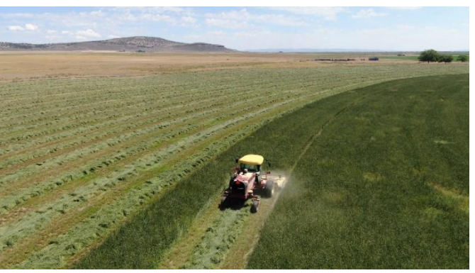
Comments: This Eastern Oregon Farm/Ranch is in an area of Harney County that has some of the best soils and highest hay production. One of the pivots is equipped with a LESA irrigation package. Most of the dryland is planted in crested wheat for good pasture. There is also an older homesite where there was a house and small set of corrals. This property has great access off a paved county road.