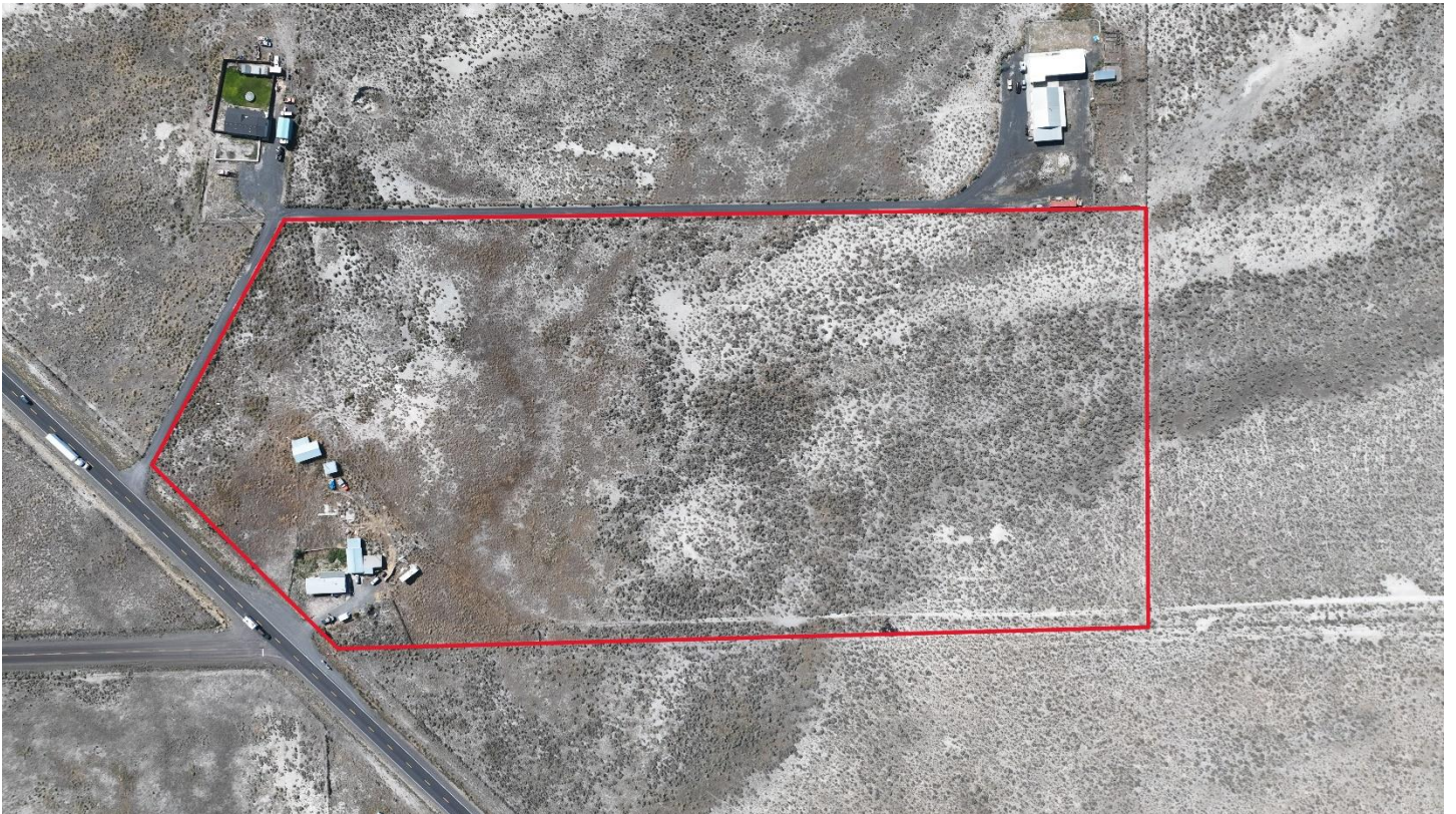
Harney County, Oregon, 21 AC +/-