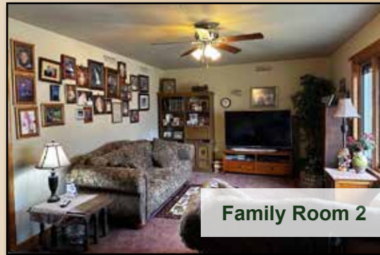
Family Room 2