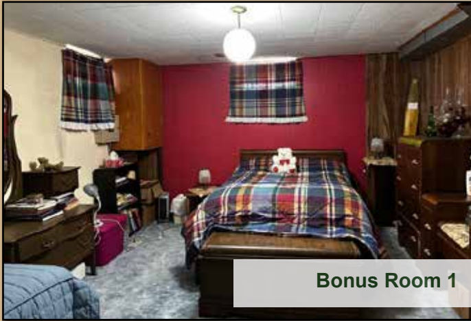
Bonus Room 1

One Family room, three bonus rooms, and one full bath