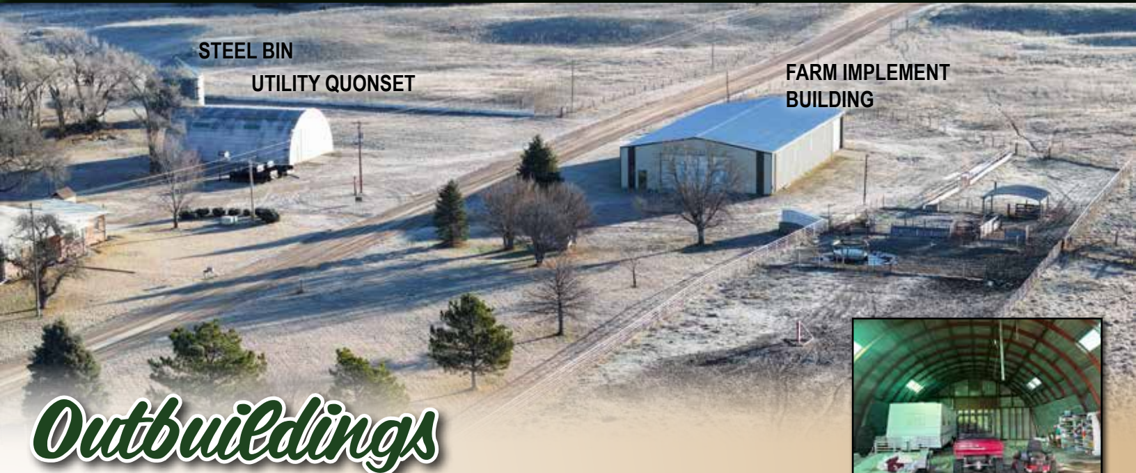
STEEL BIN UTILITY QUONSET