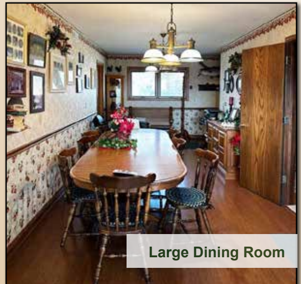
Large Dining Room