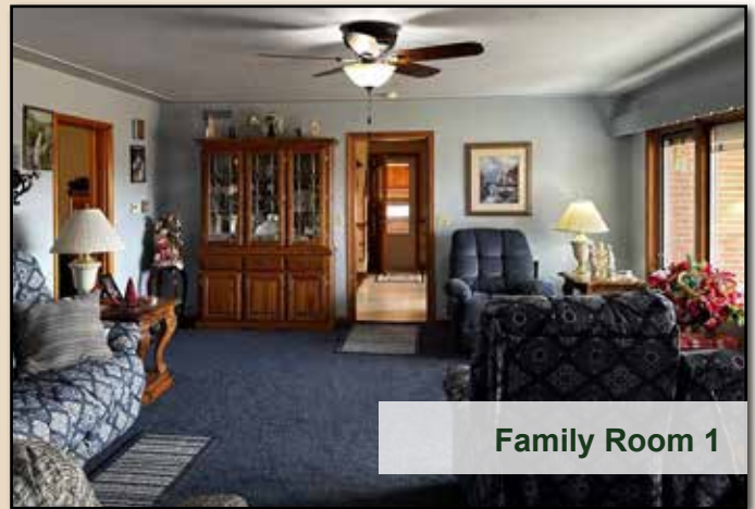
Family Room 1

YEAR BUILT 1955 • Nicely updated kitchen • Large dining room • Two living spaces upstairs, one downstairs • Central heat/air • Handicap access • Laundry on main level • Stand-by generator • Basement cellar • Lots of storage in garage & basement • Concrete basketball court • NEW roof in 2022 • Automatic sprinkler system