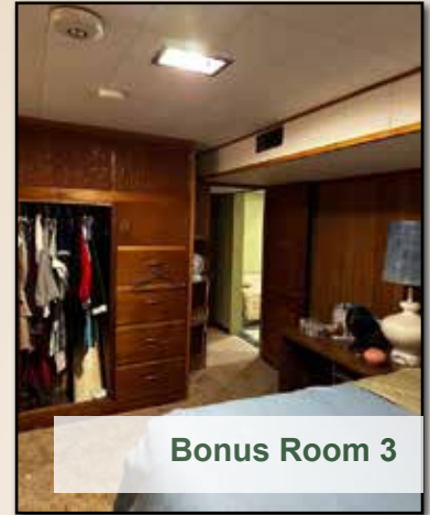
Bonus Room 3