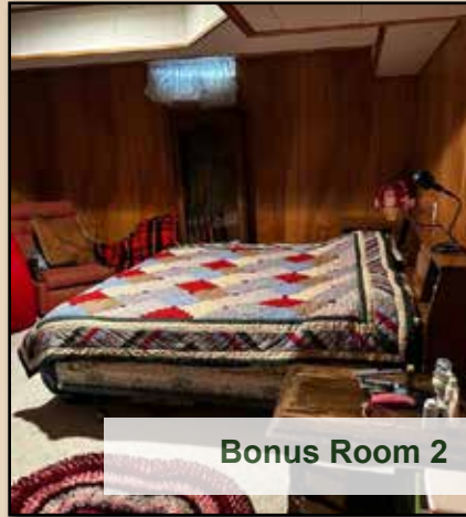
Bonus Room 2