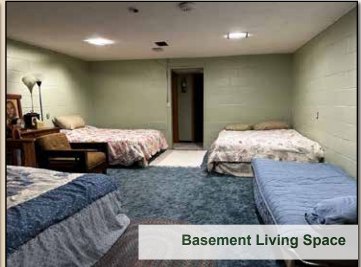
Basement Living Space