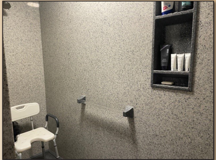
Main floor bathrooms are newly remodeled with walk-in Onyx showers. One bath is handicap accessible.