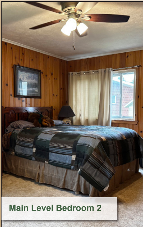
Main Level Bedroom 2