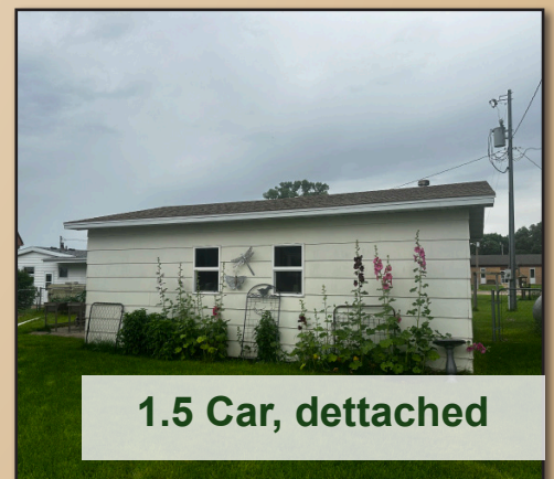
1.5 Car, detached