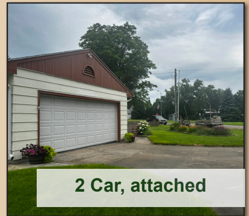
2 Car, attached