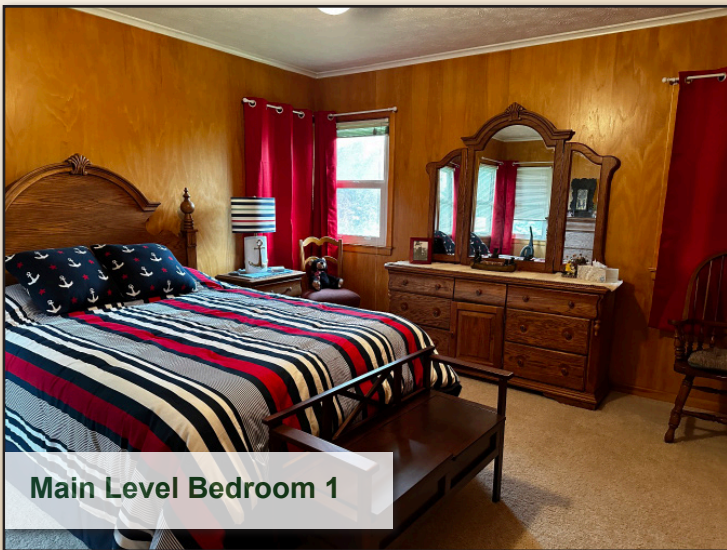
Main Level Bedroom 1