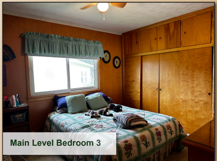
Main Level Bedroom 3