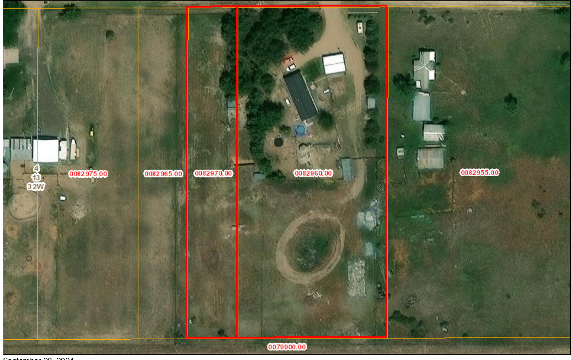
September 28, 2024 DISCLAIMER: This map is not intended for conveyances, nor is it a legal survey. The information is presented on a best-efforts basis, and should not be relied upon for making financial, survey, legal or other commitments.