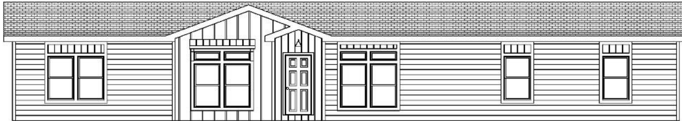
* STANDARD VINTAGE EXTERIOR