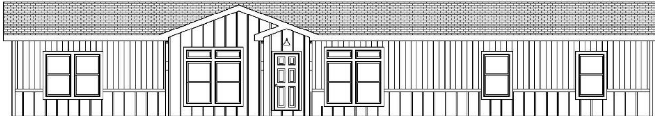
OPTIONAL SUN RANCH EXTERIOR