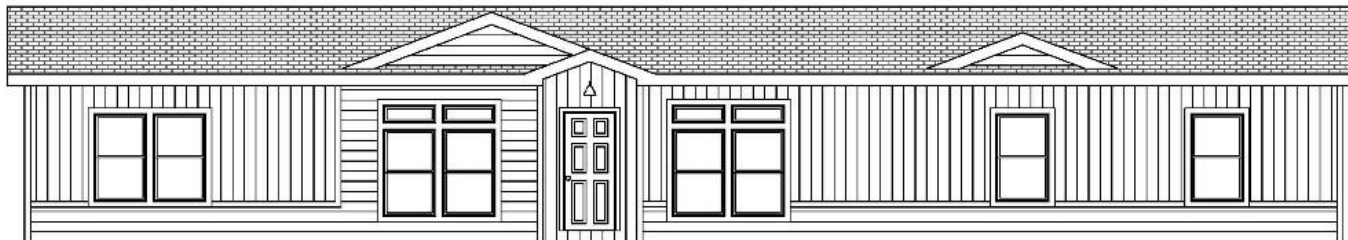
OPTIONAL RIDGELINE EXTERIOR

Because Palm Harbor Homes has a continuous product updating and improvement process, specifications are subject to change without notice or obligation. Likewise, the floor plan shown is representative only and may vary from the actual home. Square footage calculations are based on nominal widths and all room dimensions are approximate subject to industry standards. R-values may vary in compressed areas. Some transportation components may have been recycled after close inspection for safety and appearance.