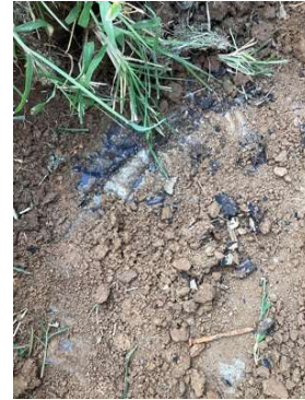
Image of Tank at Time of Inspection