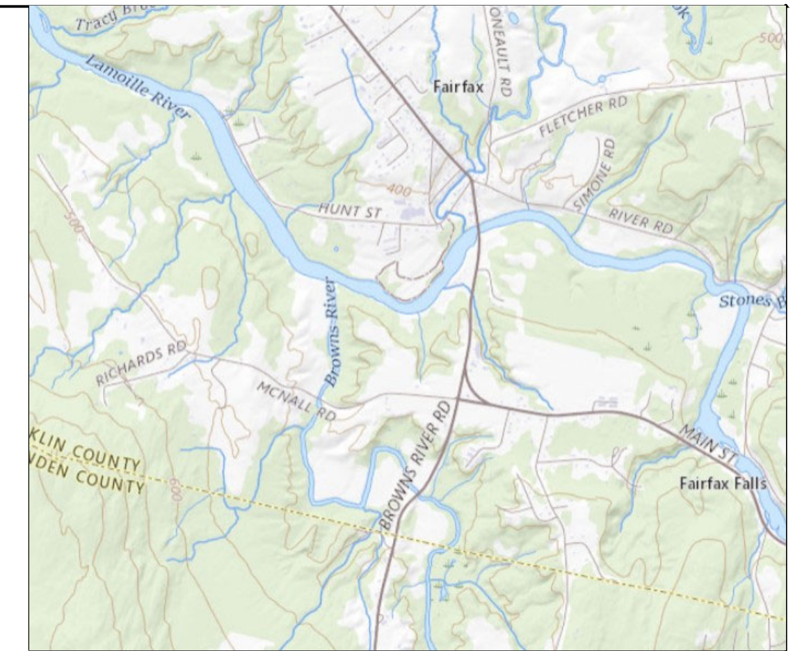
LOCUS MAP NOT TO SCALE