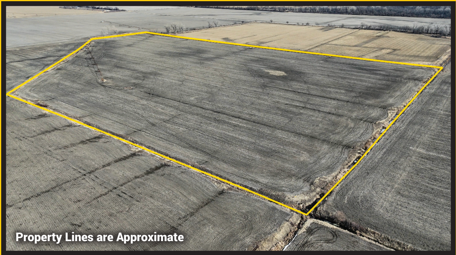
Property Lines are Approximate