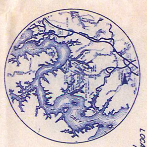
LOCATION SKETCH N. 1. S.