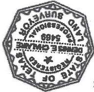
EXHIBIT "A" - Page 1 of 2 Pages